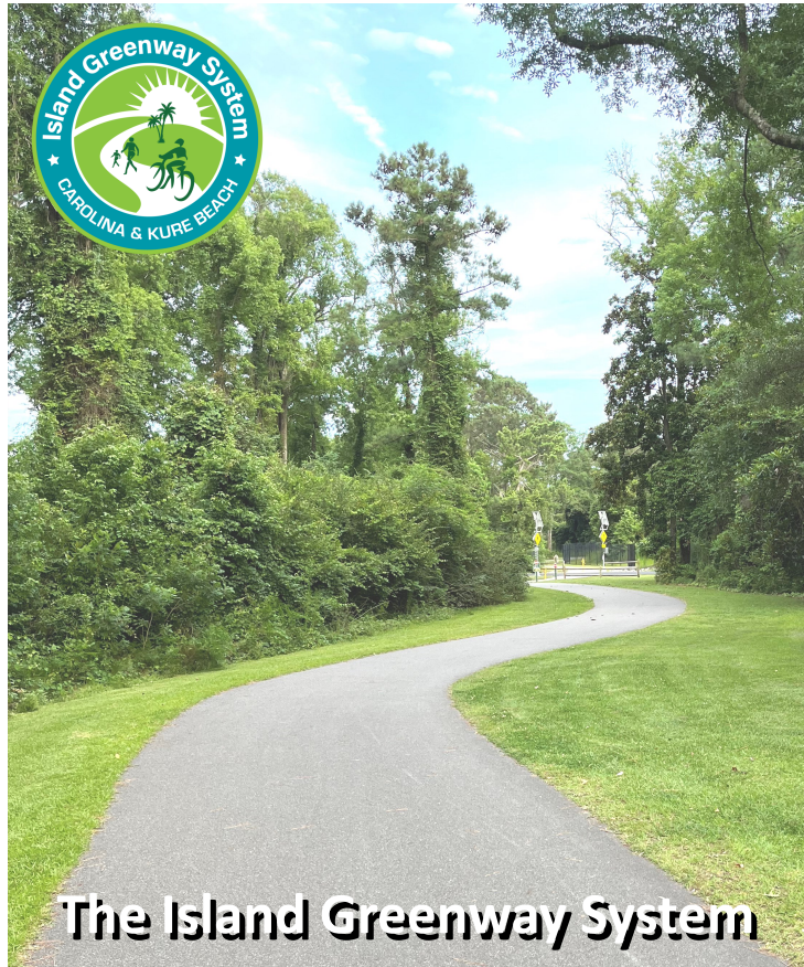
The Island Greenway System

A network of off-street trails, parks and scenic areas connected by designated bike/pedestrian routes on our existing streets.