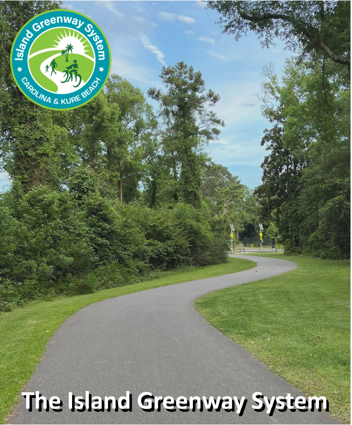
The Island Greenway System

A network of off-street trails, parks and scenic areas connected by designated bike/pedestrian routes on our existing streets.